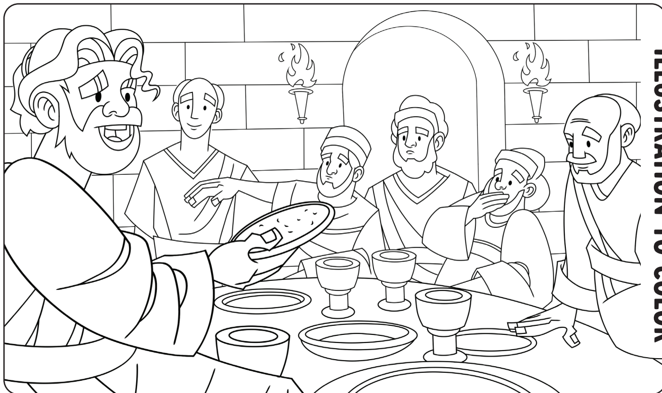
ILLUSTRATION TO COLOR