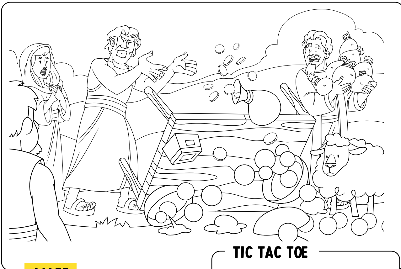
ILLUSTRATION TO COLOR

YOUNGER ELEMENTARY CLEANSING OF THE TEMPLE